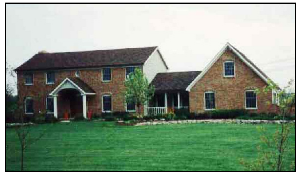
Worthington I B Basement

27'-4" x 40'/44', Total Living Area 2721 Sq. Ft.